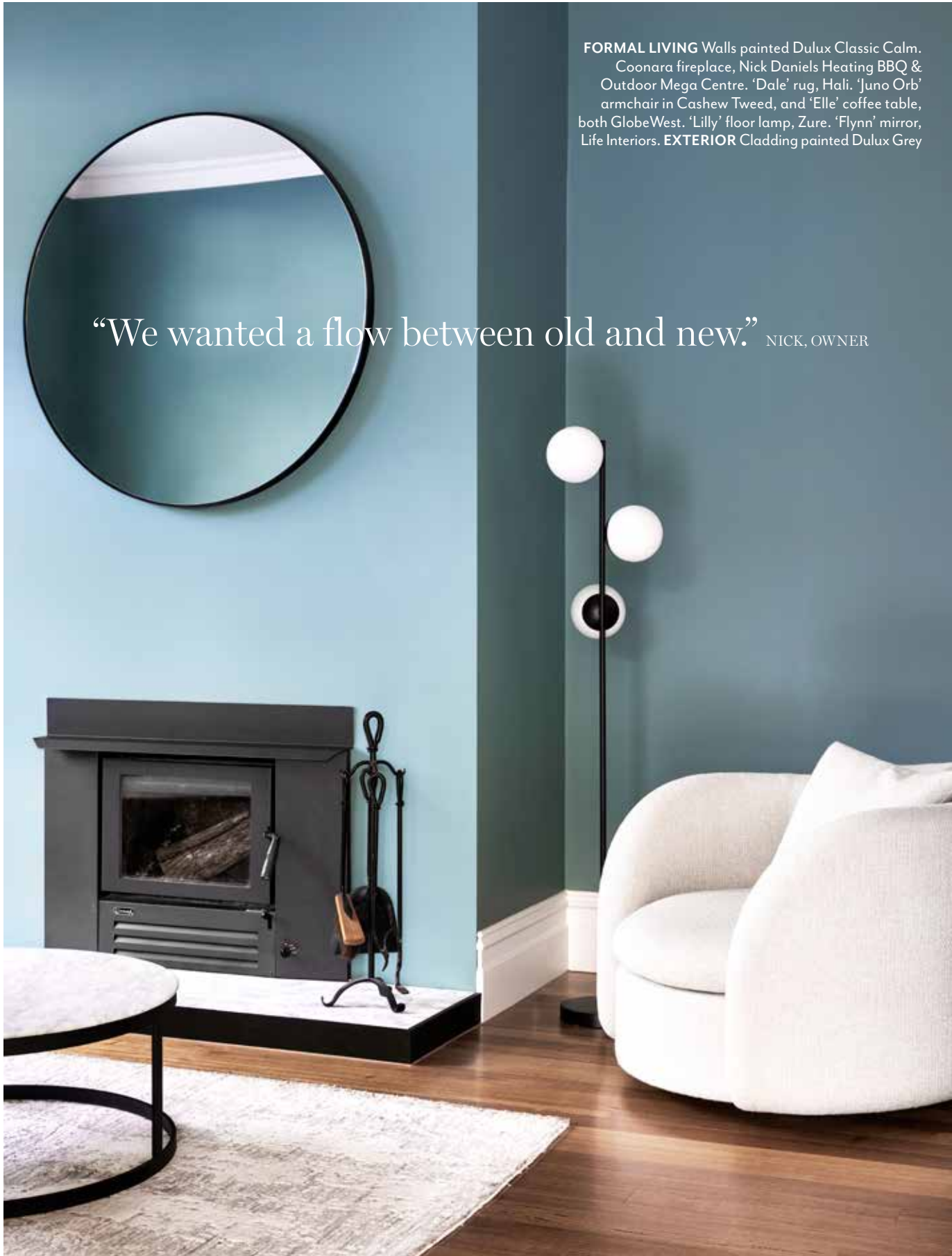
FORMAL LIVING Walls painted Dulux Classic Calm. Coonara fireplace, Nick Daniels Heating BBQ & Outdoor Mega Centre. 'Dale' rug, Hali. 'Juno Orb' armchair in Cashew Tweed, and 'Elle' coffee table, both GlobeWest. 'Lilly' floor lamp, Zure. 'Flynn' mirror, Life Interiors. EXTERIOR Cladding painted Dulux Grey